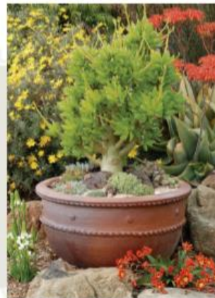
South African Garden

The arboretum is open year around. Hours are from 8 a.m. to 5 p.m. Monday through Saturday; closed on Sundays and academic holidays. There is no admission fee. Guided group tours may be available by prior arrangement.